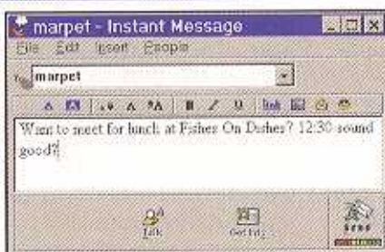
➔ AOL Instant Messenger (AIM) is another very popular instant-messaging program.

If you decide to install multiple instant-messenger programs, you'll want to look into a clever program called Trillian to help you manage them (refer to the sidebar "Managing Multiple IM Programs" for details).